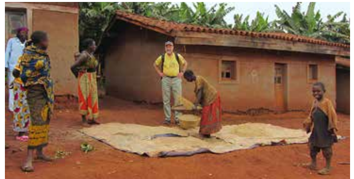
Rice sifting in Burundi village

All three of these stories are examples of the "best case thinking" that Elise Boulding (2000) insists we must report. Her book, Cultures of Peace , contrasts the "worst case thinking" that pulls many people toward events of violence, toward a history that is too focused on